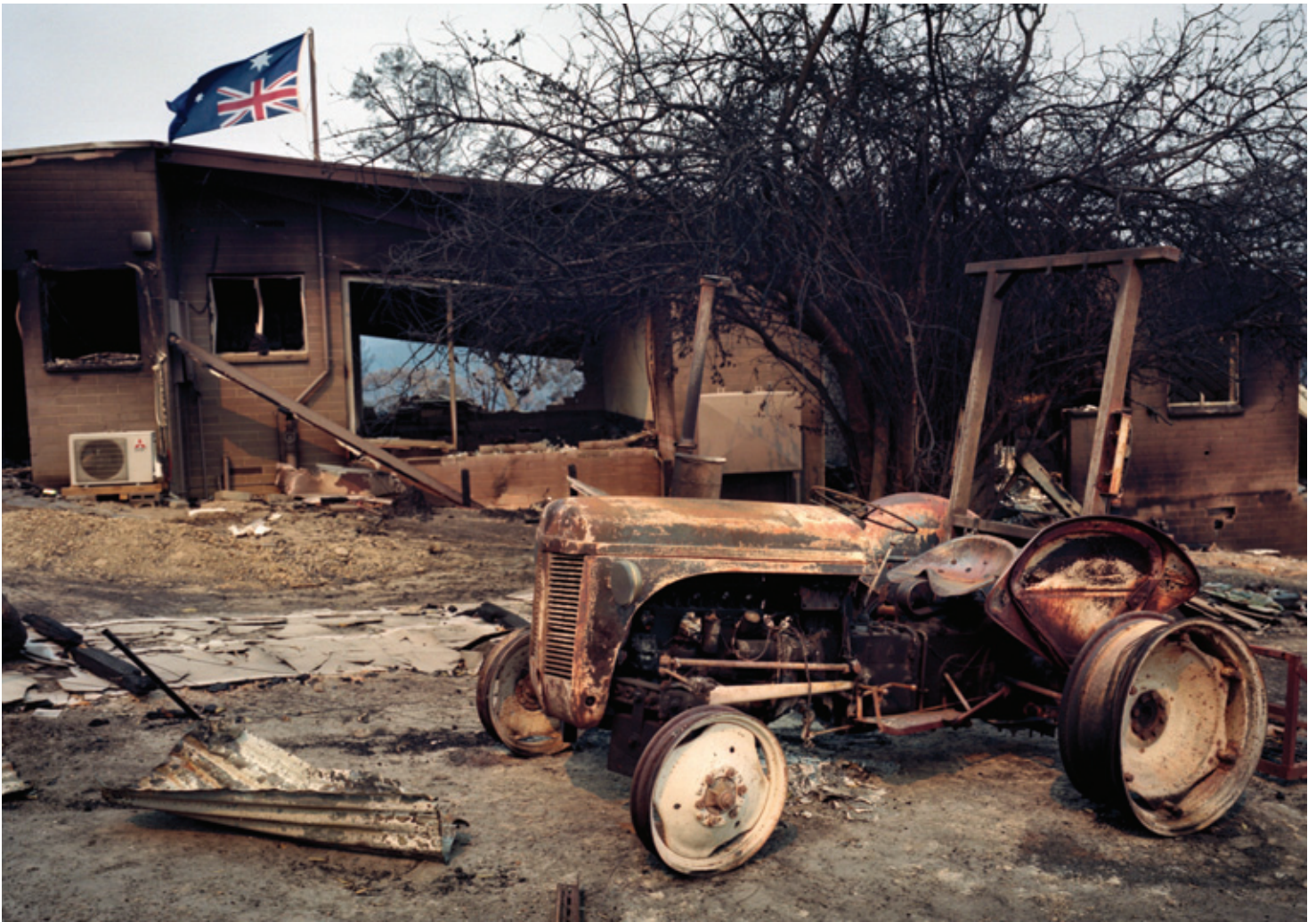
Australian flag upside down 'symbol of distress', Victorian Bushfires 2009

The best chance of avoiding a high global warming scenario is through a fair, ambitious and legally binding international treaty to cut emissions. Millions of people around the world demanded that world leaders deliver this treaty at the Copenhagen Climate Summit in