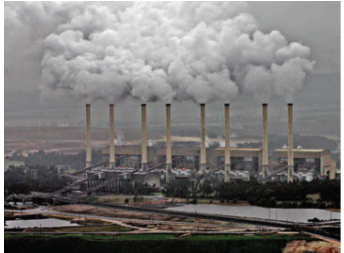
The single biggest cause of greenhouse pollution is burning coal for electricity. Hazelwood Power Station Vic.

Neville Nicholls, Australian-based climate scientist