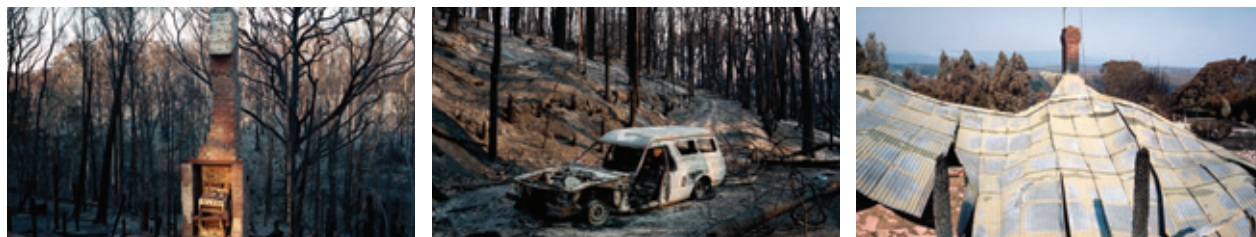
Aftermath of the Victorian Bushfires, February 2009.