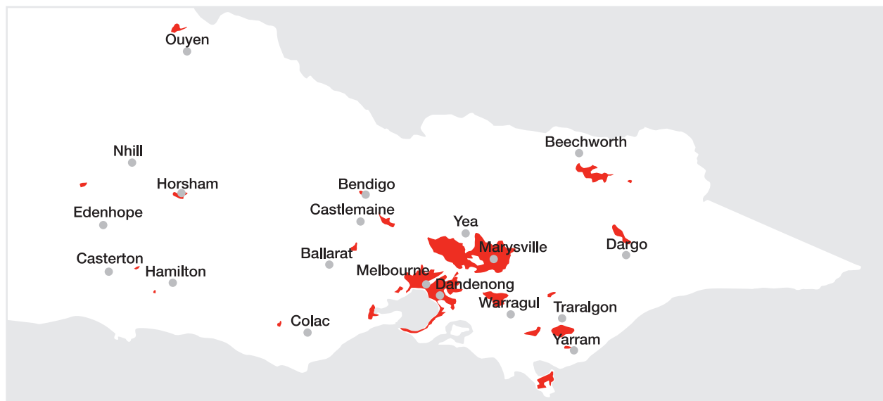
Location of bushfires in Victoria up to 23 February 2009.

The Black Saturday bushfires were devastating, destroying the towns of Kinglake and Marysville as nearly half a million hectares were burned. Over 400 people were injured and 173 lost their lives. 6